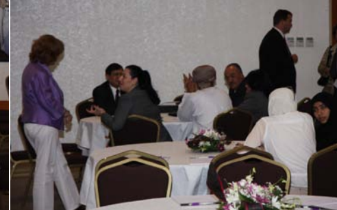
OQN AGM Meeting 2010