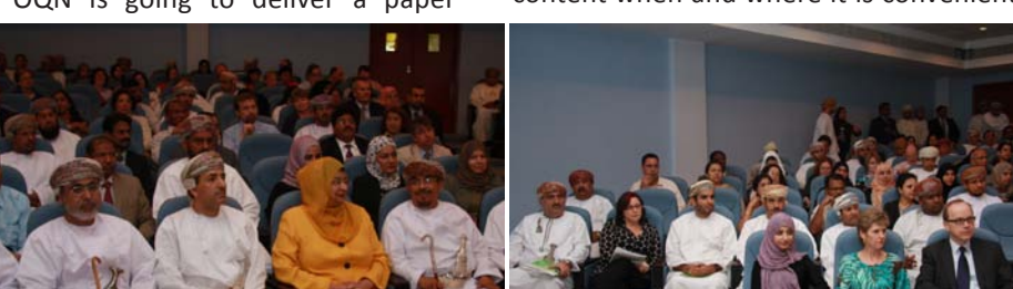
OQN Seminar March 2010

The most visible positive effects experienced across the CAS system have been transformations in the nature of student-lecturer communication and security. Students can access course content when and where it is convenient