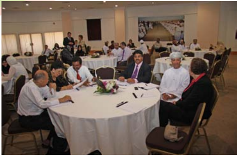
OQN AGM Meeting 2010