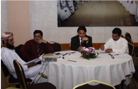
OQN AGM Meeting 2010