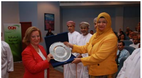
OQN Seminar March 2010