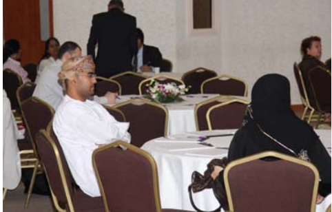
OQN AGM Meeting 2010